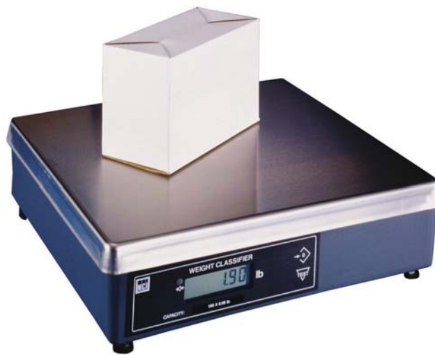
NCI Model 7820 shown with standard flat shroud