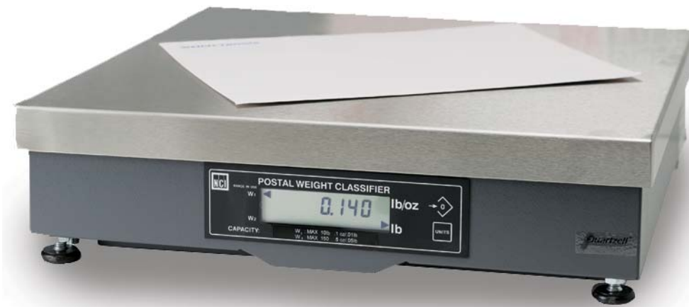
NCI Model 7680 shown with standard flat weight platter