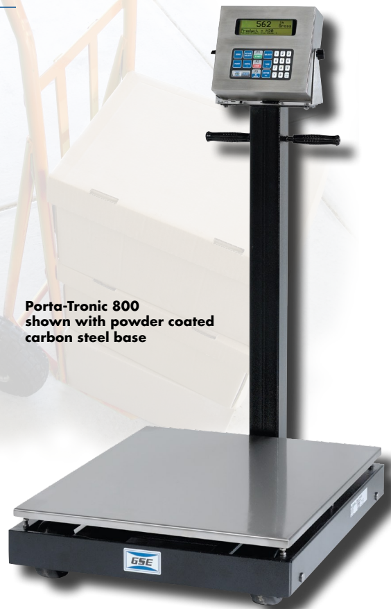
Porta-Tronic 800 shown with powder coated carbon steel base