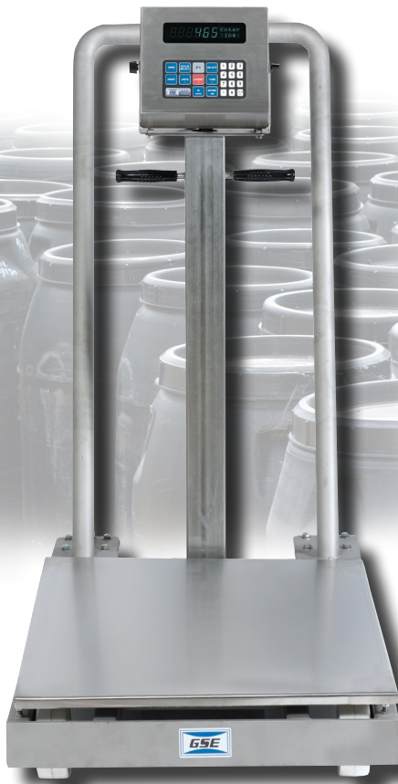
Porta-Tronic 800 shown with stainless steel base

The Porta-Tronic 800 was designed for mobile weighing in light to medium capacity applications. Smooth, portable operation maximizes efficiency when weighing in multiple areas. Numerous options provide flexibility for custom applications.