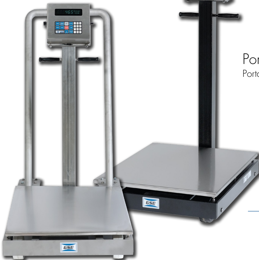
Porta-Tronic 800 Portable Scale