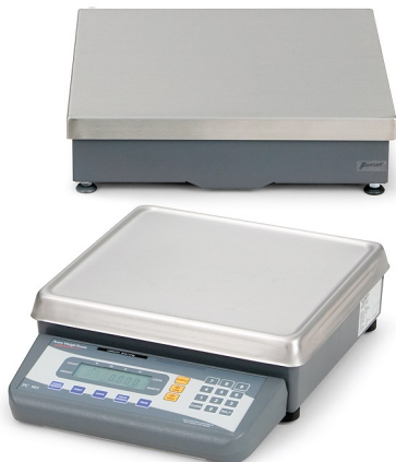
PC-905 with optional remote base.

Lets operators enter and recall known piece weights and tare weights.