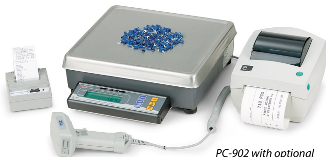
PC-902 with optional barcode gun and printers.