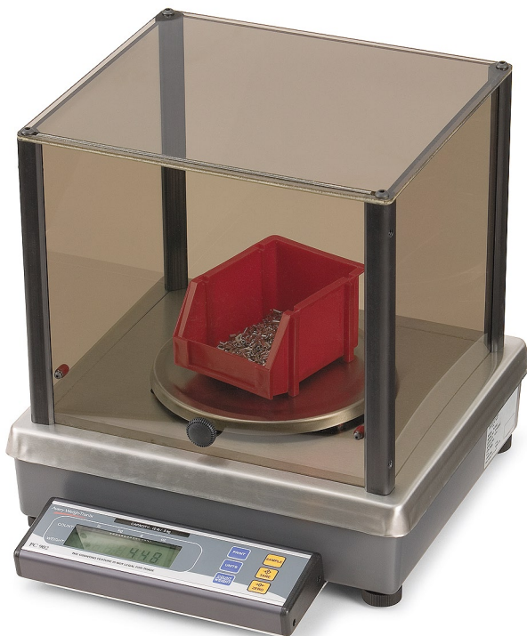
PC-902 with draft shield.

Maintaining quality control is also critical. Companies want to give their customers exactly what they paid for. Time and again, shipping less than ordered leads to dissatisfaction and lost customers. Accuracy translates to freeing up of capital and satisfied customers.